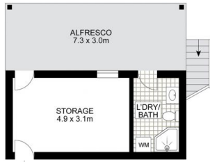
TO SUB FLOOR BASEMENT